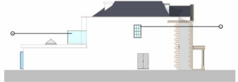
4 Proposed West Side Elevation 1:100