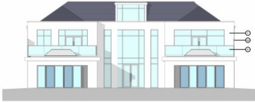
2 Proposed Rear Elevation 1:100