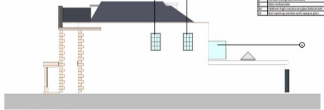
3 Proposed East Side Elevation 1:100