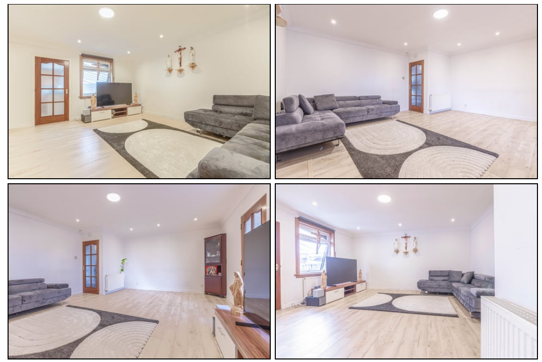
4.7m x 5.0m (15' 5" x 16' 5")