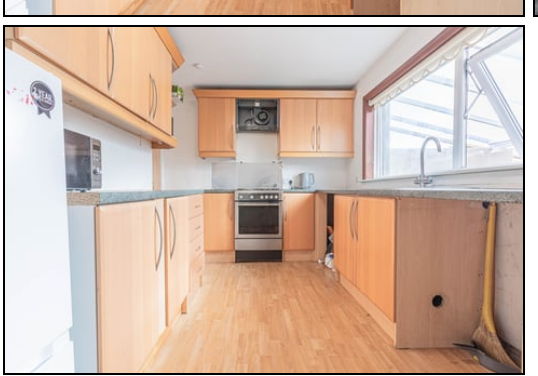
4.2m x 2.5m (13' 9" x 8' 2")