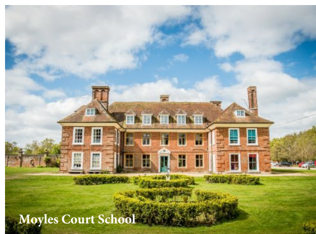
Moyles Court School