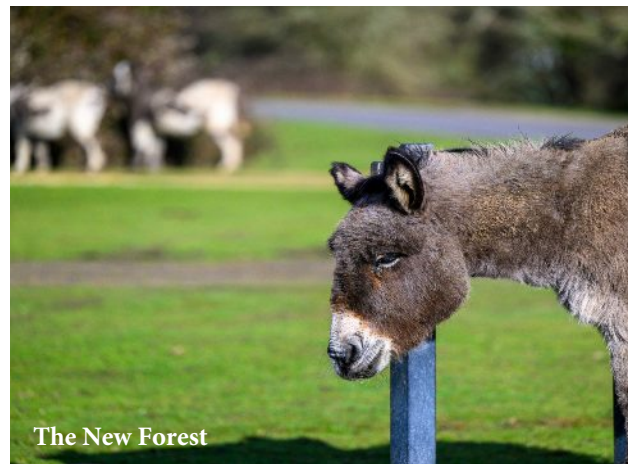
The New Forest