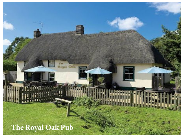
The Royal Oak Pub