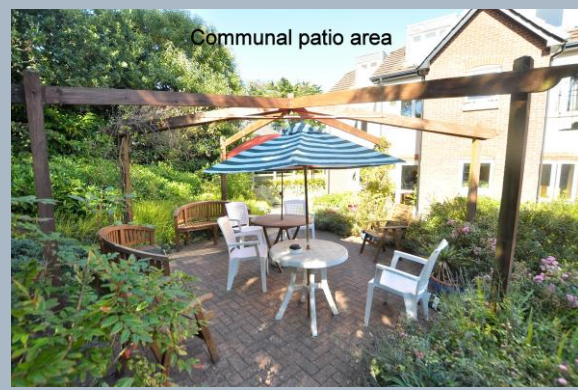
Communal patio area