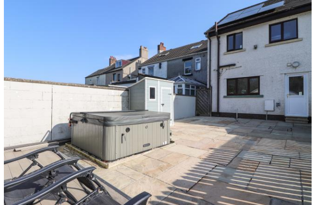
REAR OF THE PROPERTY