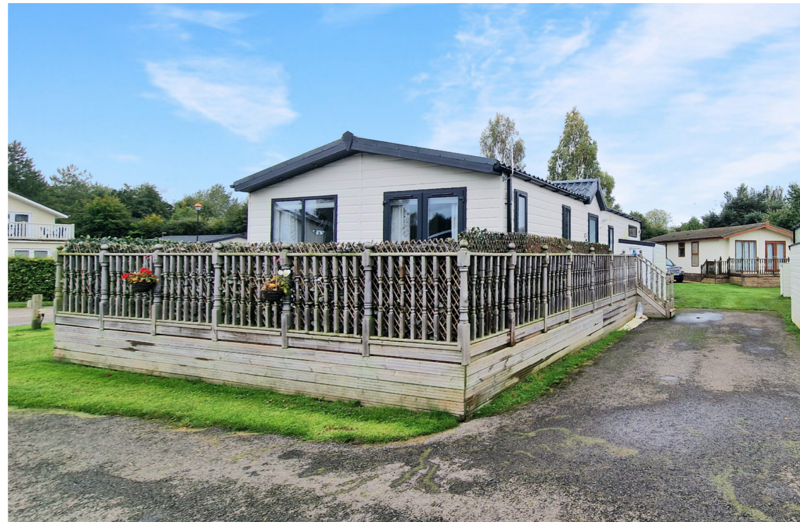
Tydd St Giles Golf & Leisure Centre 48 Carnoustie Court PE13 5NZ £150,000