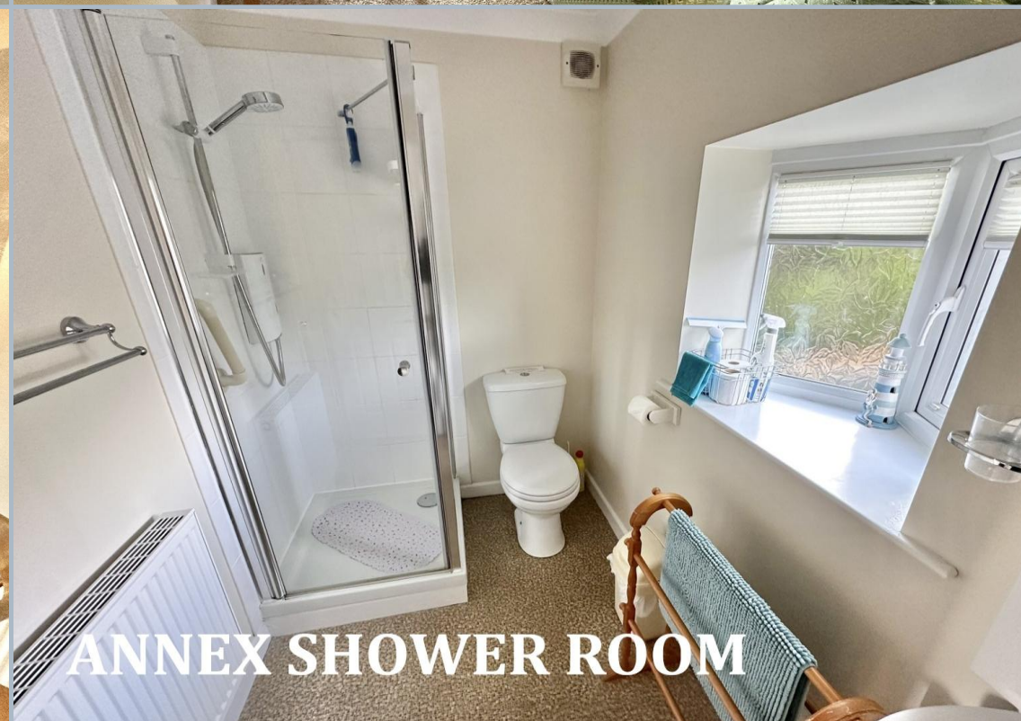
ANNEX SHOWER ROOM