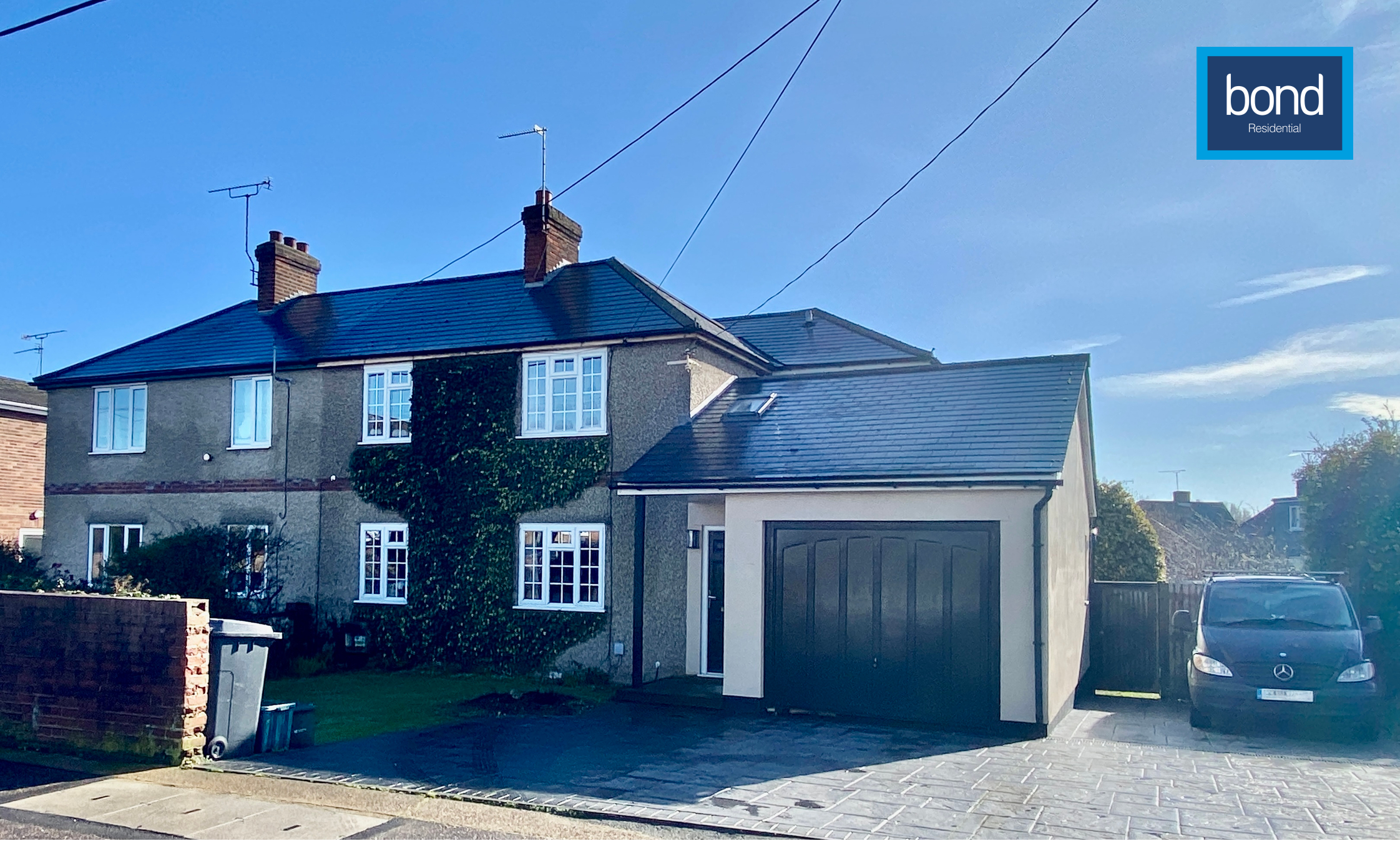
274 Broomfield Road, Chelmsford, Essex, CM1 4DY