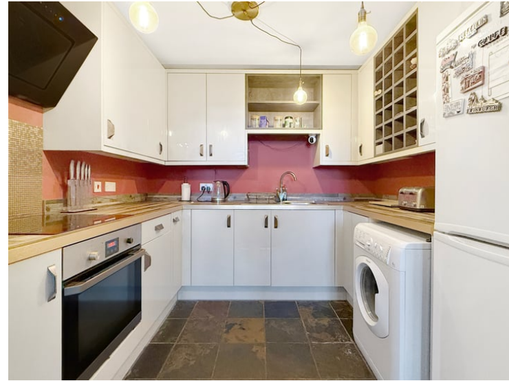
8' 9" x 8' 0" (2.67m x 2.44m)