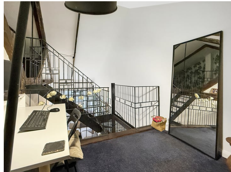
9' 2" x 8' 3" (2.79m x 2.51m)