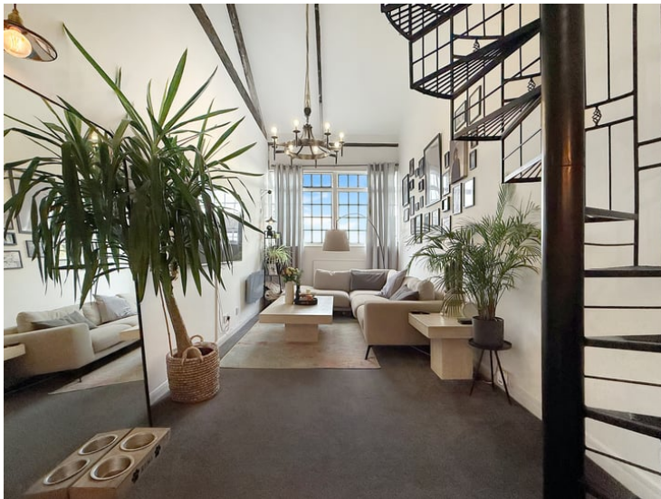
22' 2" x 8' 9" (6.76m x 2.67m)