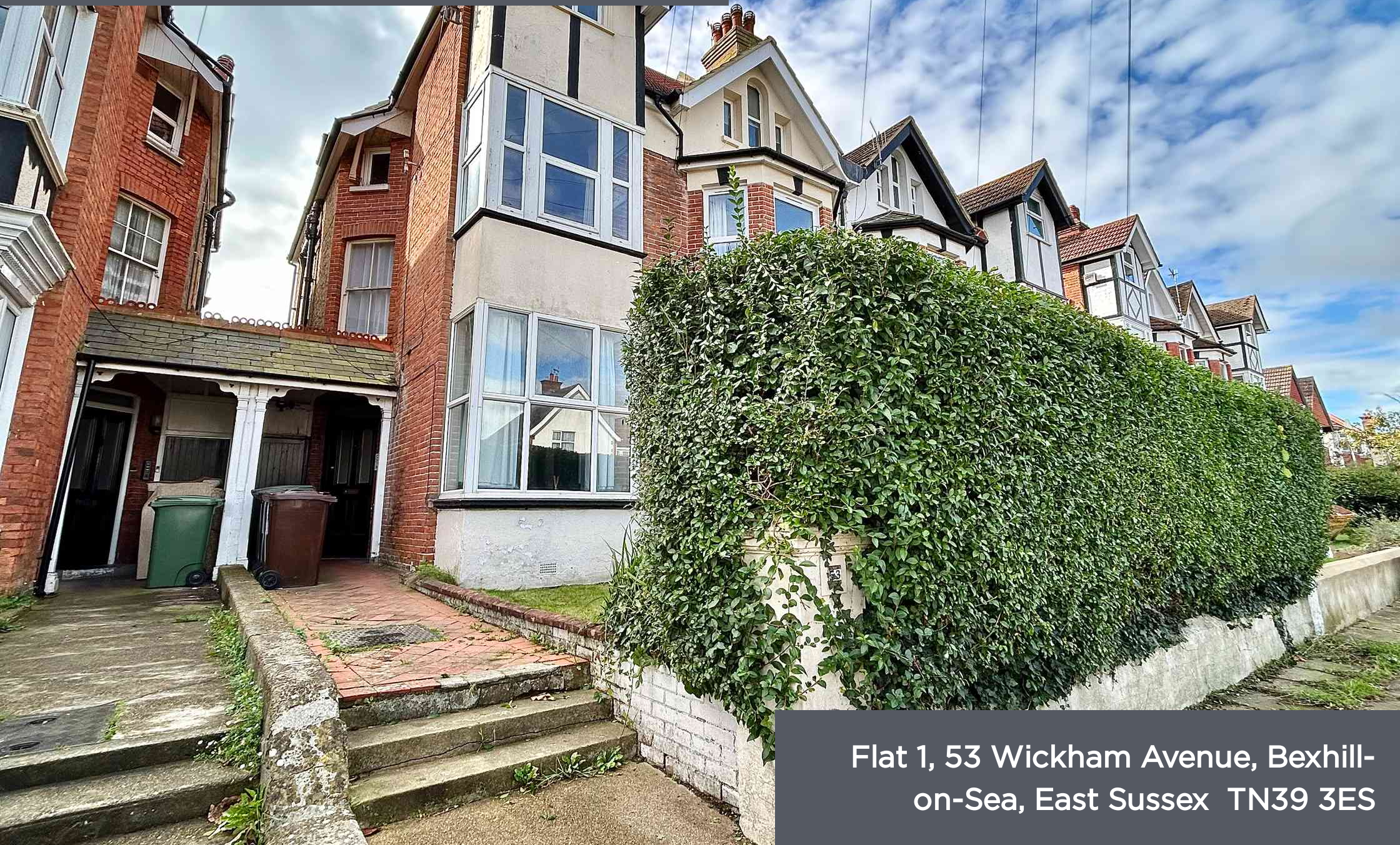
Flat 1, 53 Wickham Avenue, Bexhill-on-Sea, East Sussex TN39 3ES