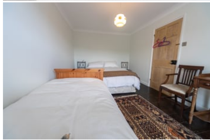
9' 3" x 15' 1" (2.82m x 4.60m) double bedroom with wash window to front enjoying sea views, multiple sockets, radiator. Original timber flooring.