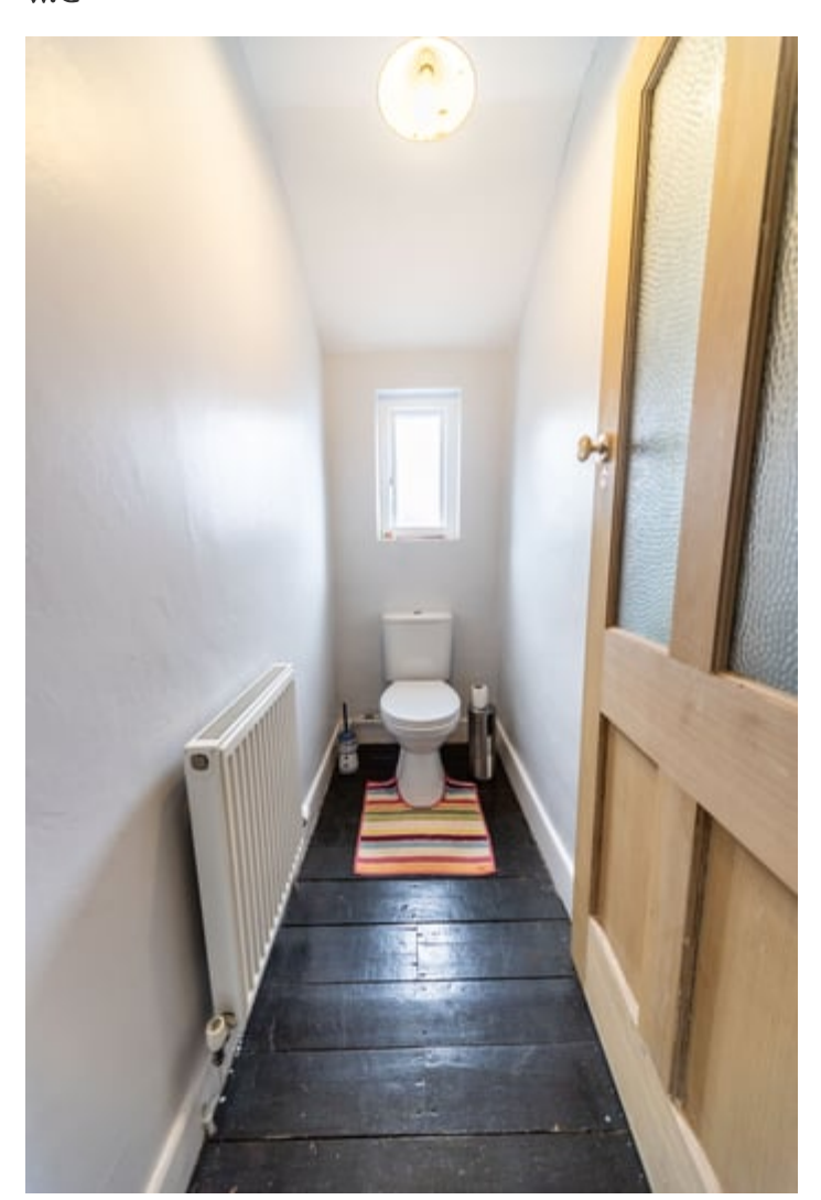
6' 5" x 3' 1" (1.96m x 0.94m) with w.c. radiator, side window. Original timber flooring.