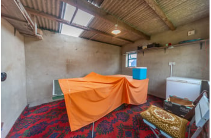
9' 3" x 12' 2" (2.82m x 3.71m) with space for table tennis table/pool table, dual aspect windows to front and side, electric socket, external socket also.