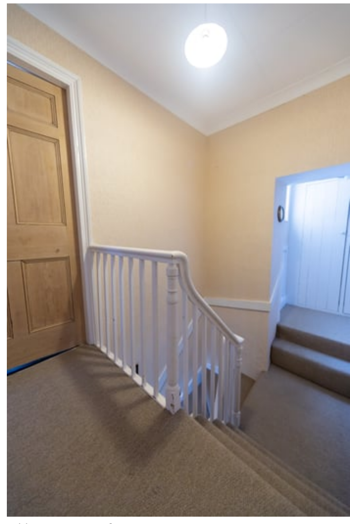
With access to Loft.