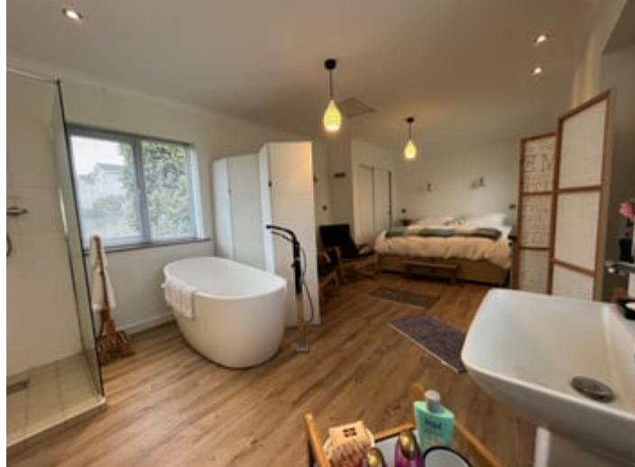
With a range of fitted wardrobes.