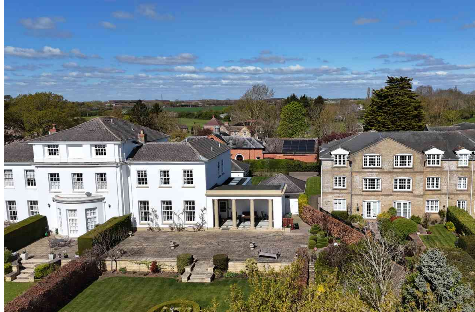
Chestnut Grove, Great Stukeley PE28 4AD