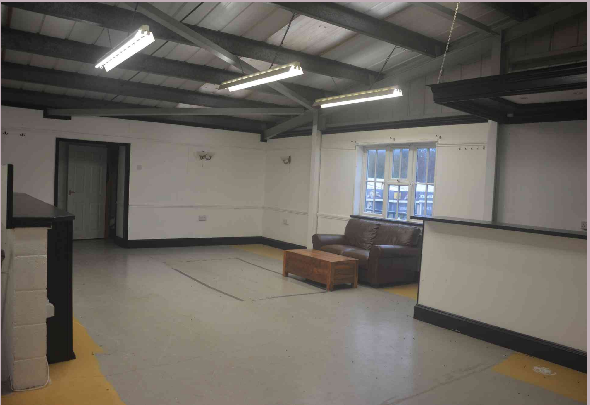
First Floor Office, Unit A2, Tottenhill Retail Park Lynn Road, Tottenhill £500 per calendar month