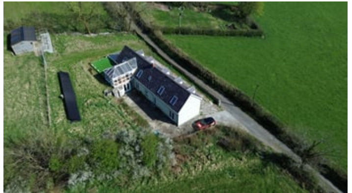
REAR OF PROPERTY (THIRD IMAGE)