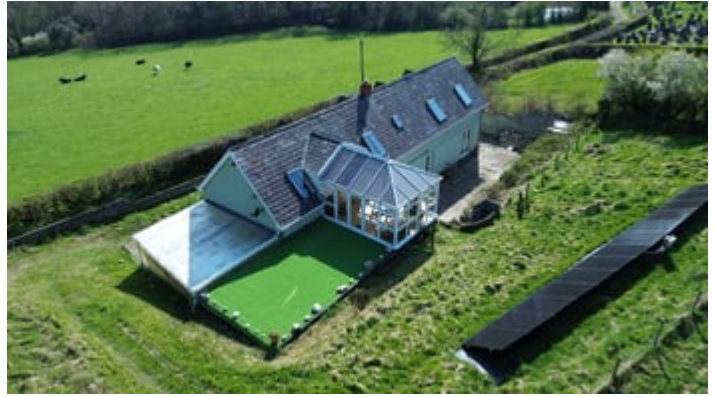
REAR OF PROPERTY (SECOND IMAGE)