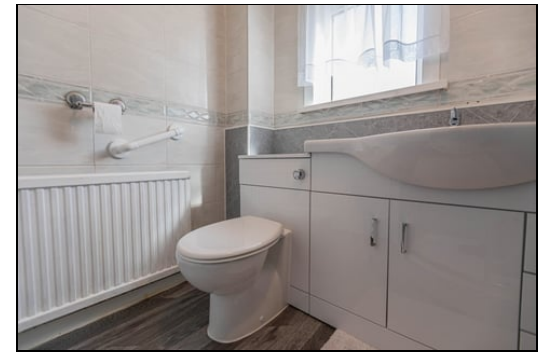
1.73m x 1.82m (5' 8" x 6' 0")