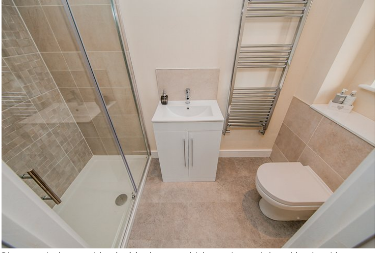
Obscure window to side, double shower cubicle, vanity wash hand basin with storage, heated towel rail, enclosed cistern WC, tiled splashbacks.