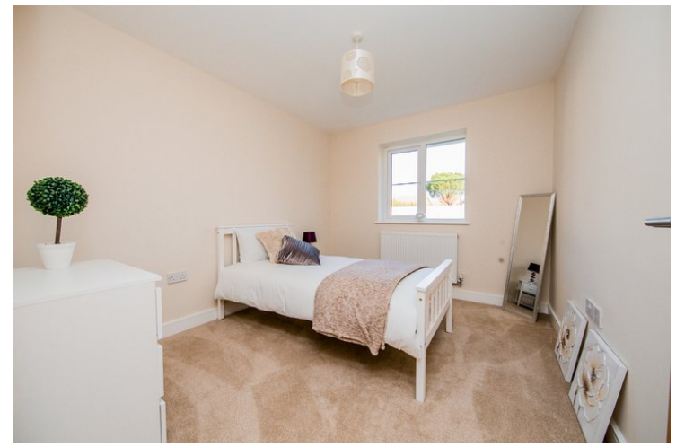
10' 9" x 9' 1" (3.28m x 2.77m) Window to rear, radiator.