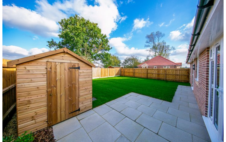
All enclosed by panel fencing, laid to lawn, patio area, garden shed, gated side access and outside tap.