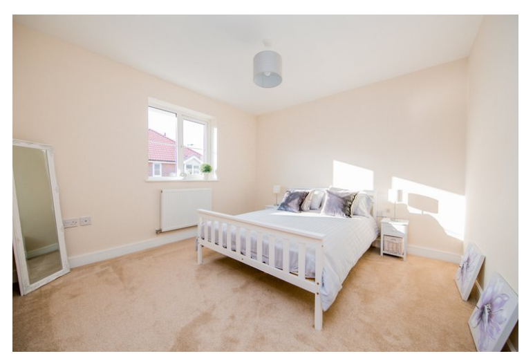
10' 10" x 10' 10" (3.30m x 3.30m) Window to front, radiator.