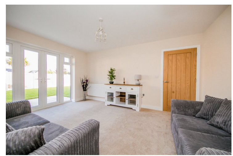
14' 9" x 10' 11" (4.50m x 3.33m) With french doors to garden, radiator, TV point, carpeted flooring.