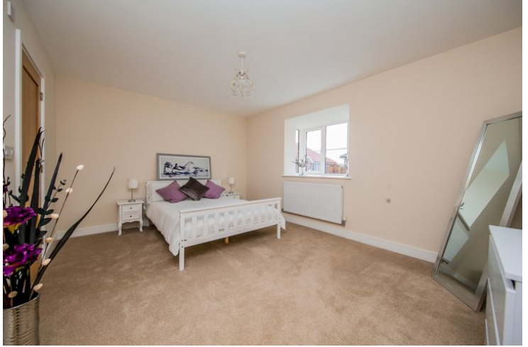
14' 9" x 11' 0" (4.50m x 3.35m) Box bay window to front, radiator and door to ensuite.