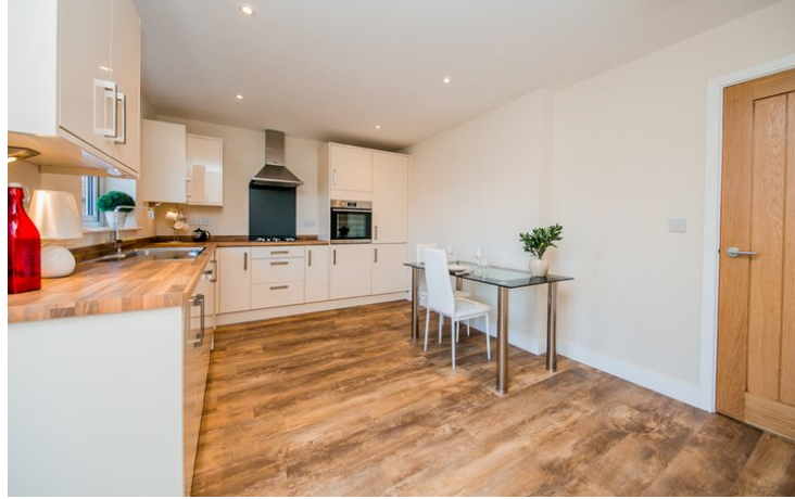
15' 10" x 10' 10" (4.83m x 3.30m) French doors to garden, window to rear, luxury vinyl flooring, radiator, contemporary fitted kitchen with worktops over, inset sink and drainer, inset gas hob, integrated dishwasher, integrated fridge/freezer, space for washing machine, matching eye level units, extractor.