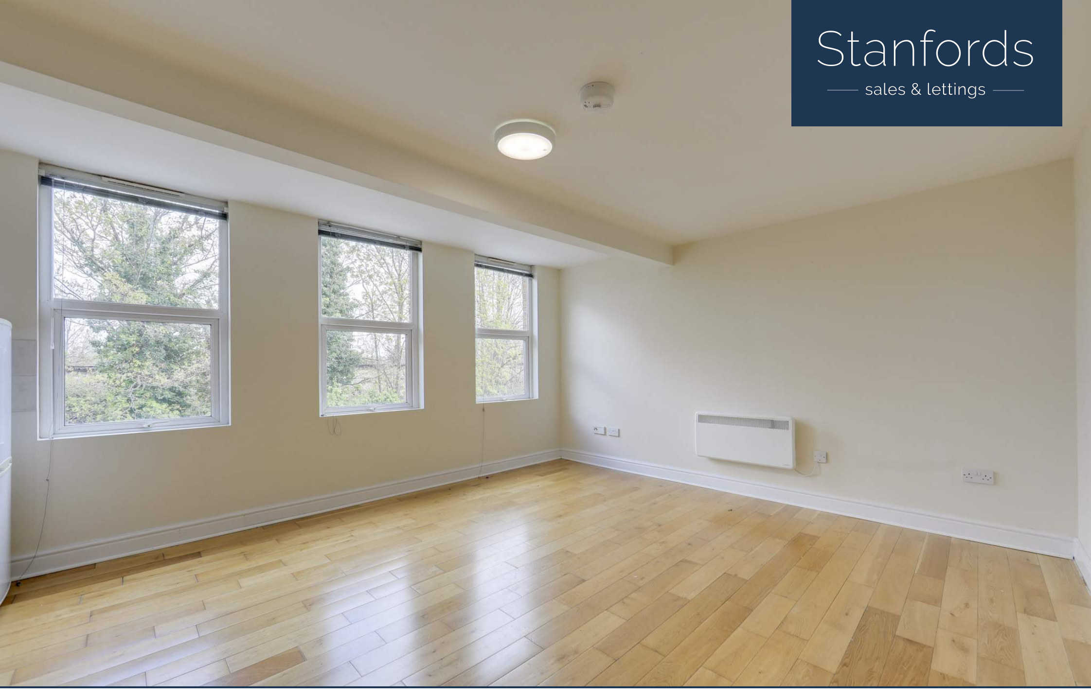
£1,300 pcm 1 bedroom flat