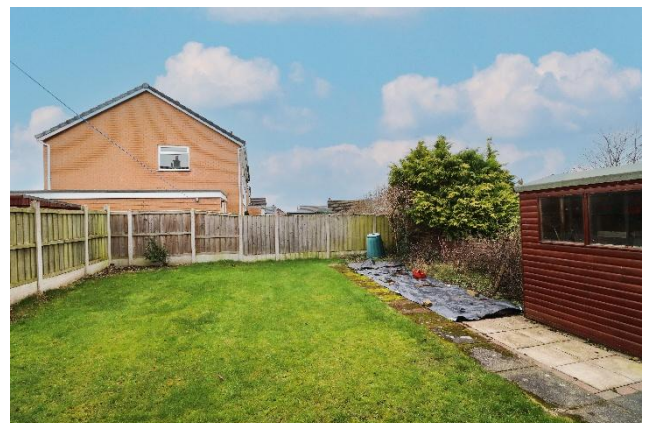
REAR OF THE PROPERTY & GARDEN

TENURE We are informed the tenure is Freehold.