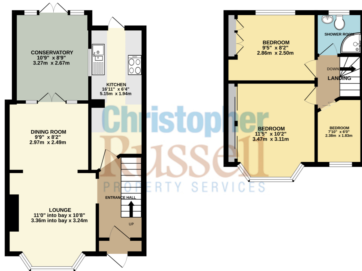
1ST FLOOR 310 sq.ft. (28.8 sq.m.) approx.

TOTAL FLOOR AREA: 768 sq.ft. (71.3 sq.m.) approx.