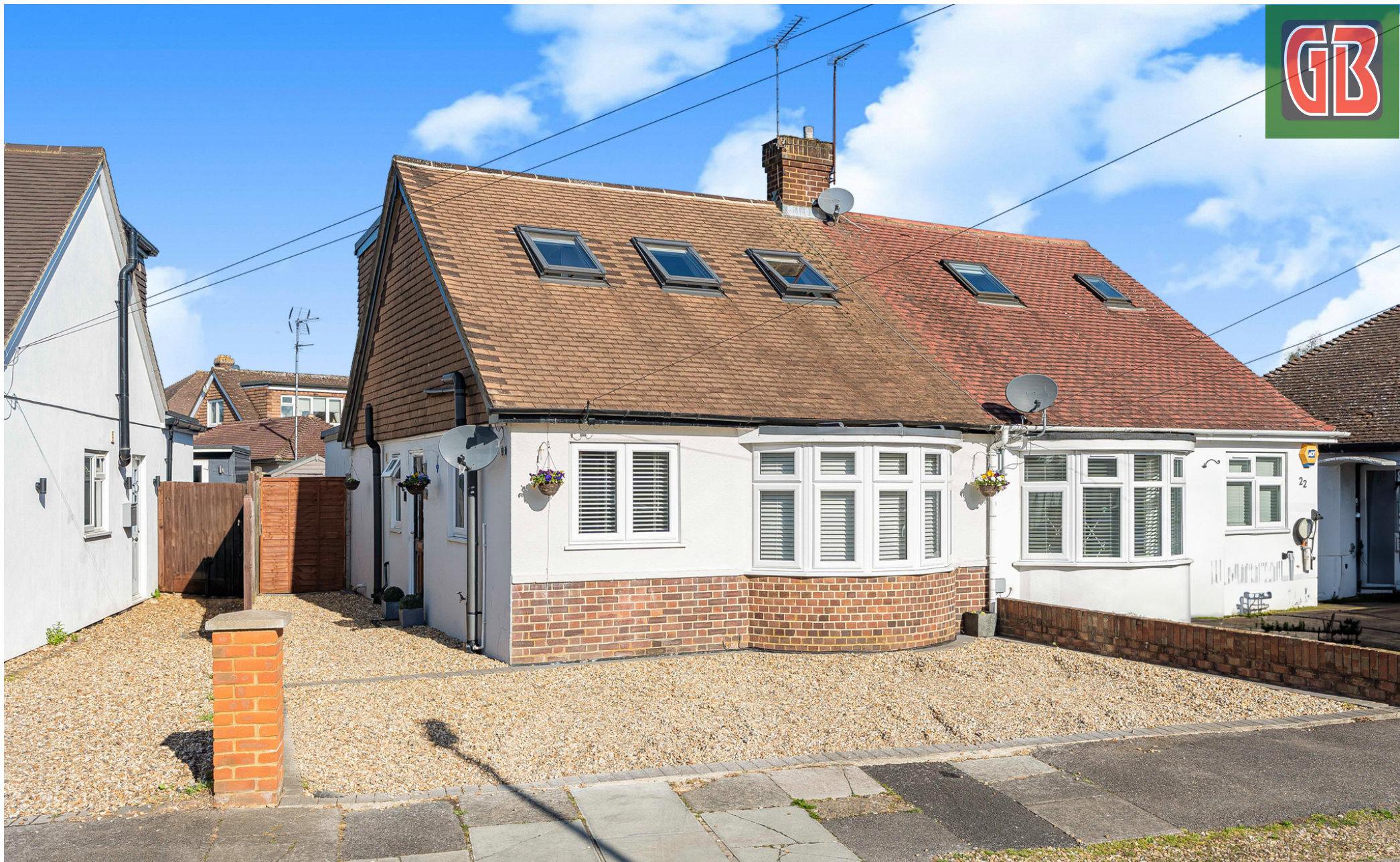
24 Westbourne Road, Staines-upon-Thames, Surrey. TW18 1HF. 4 Bedroom Semi-Detached House - £570,000 Freehold