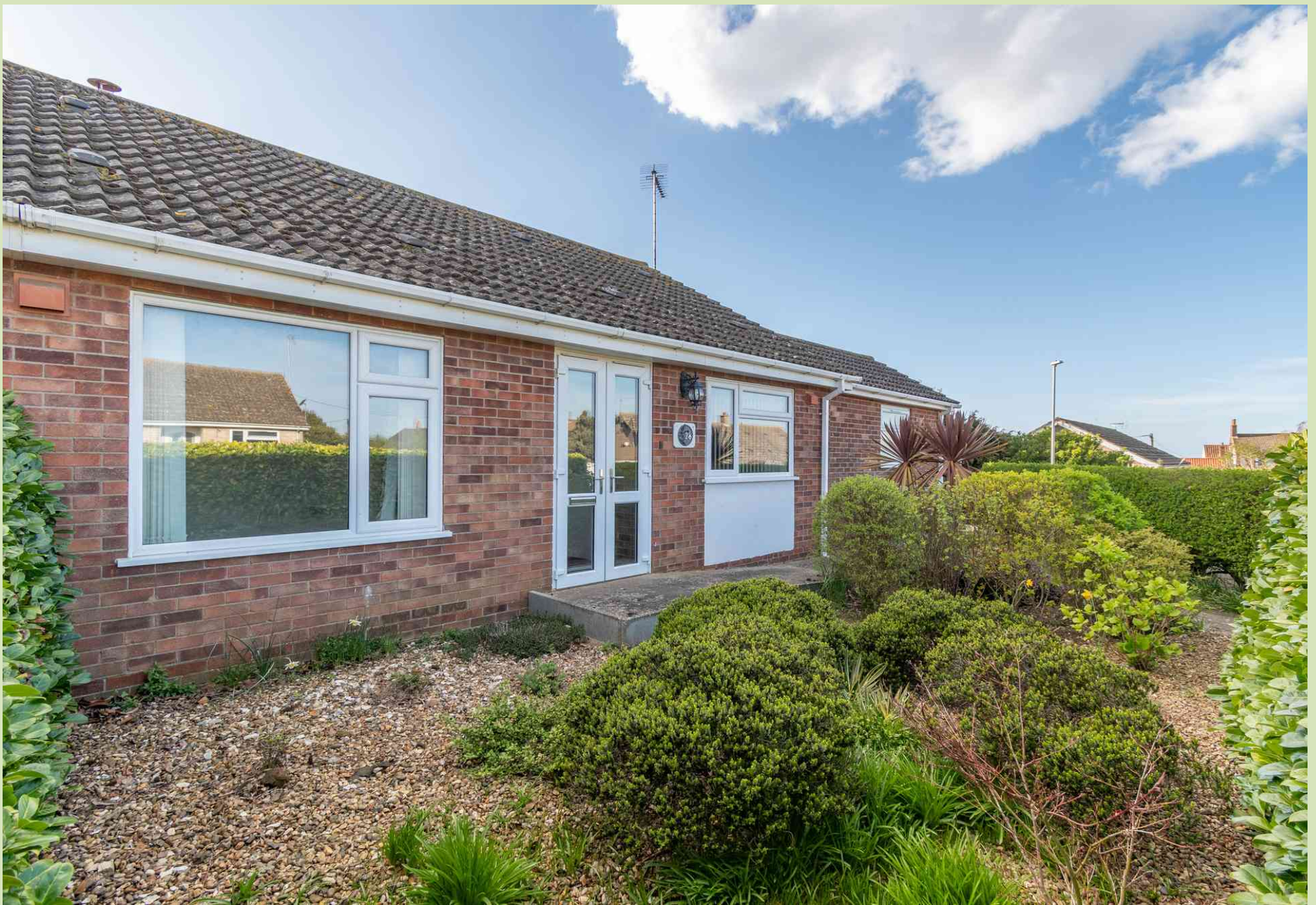
28 Castle Cottages, Thomham Guide Price £275,000