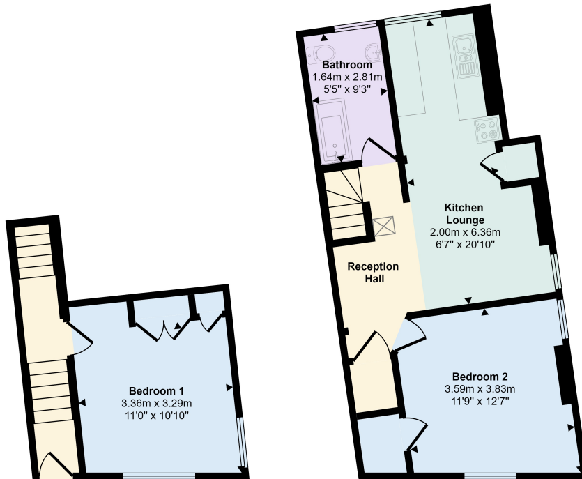
Ground Floor Approx 18 sq m / 191 sq ft

Approx Gross Internal Area 62 sq m / 671 sq ft