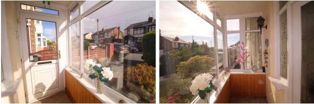
0.85m x 2.35m (2' 9" x 7' 9") PVC double glazed windows, tiled flooring.