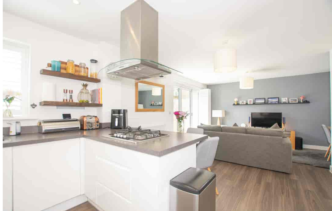
95 Brassie Wood, Channels, Chelmsford, Essex CM3 3FP £400,000 - Freehold