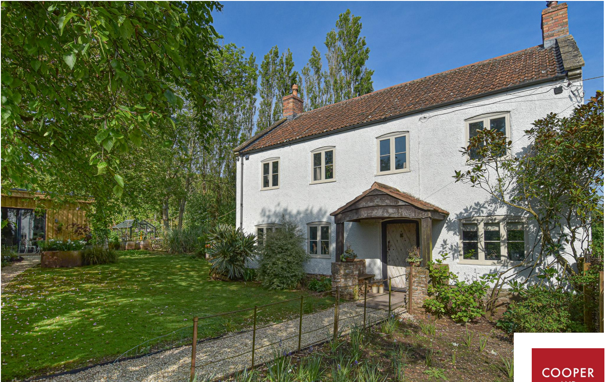
Crate Farmhouse, Nyland BS27 3UD