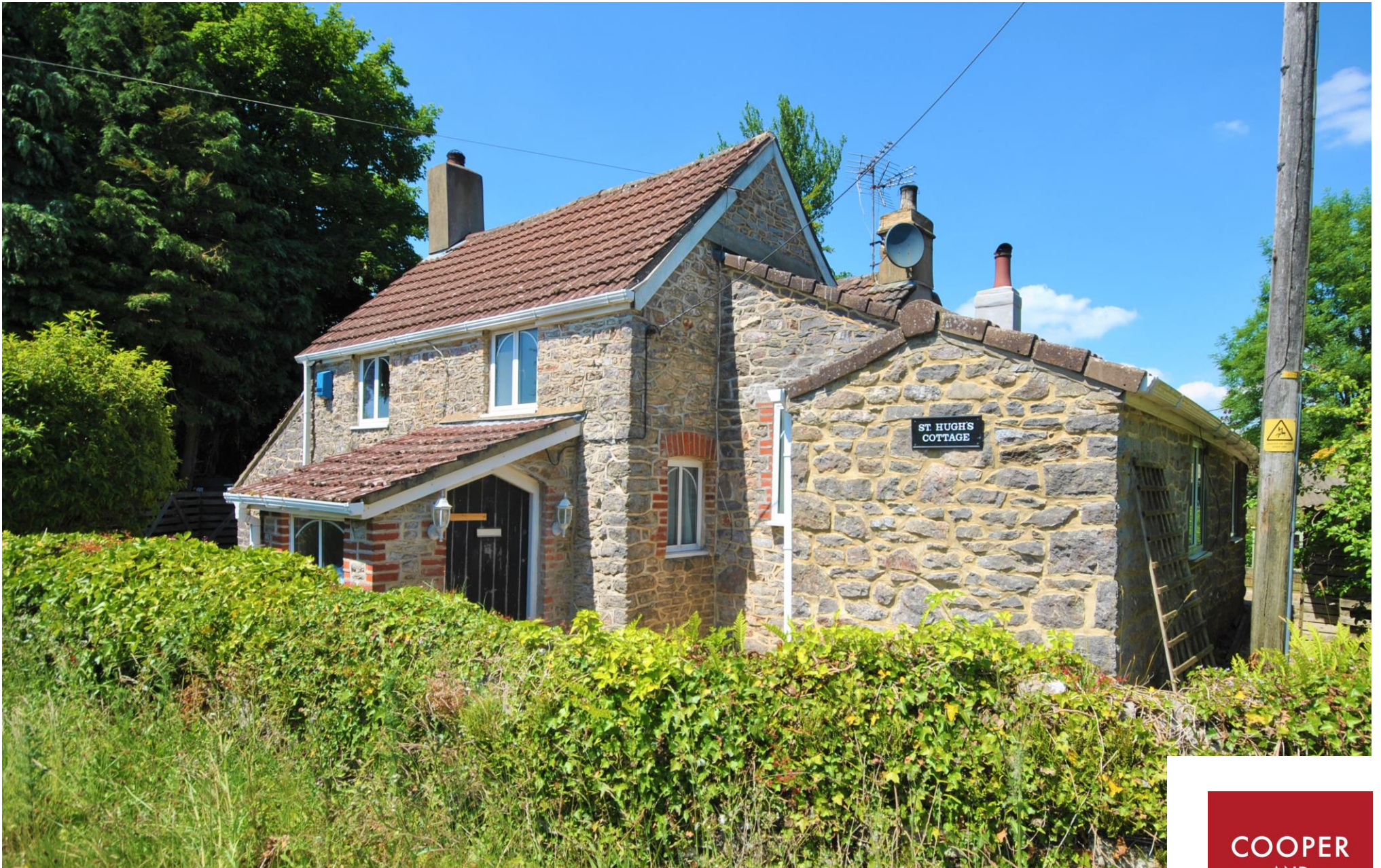
St Hughes Cottage, Charterhouse, BS40 7XR