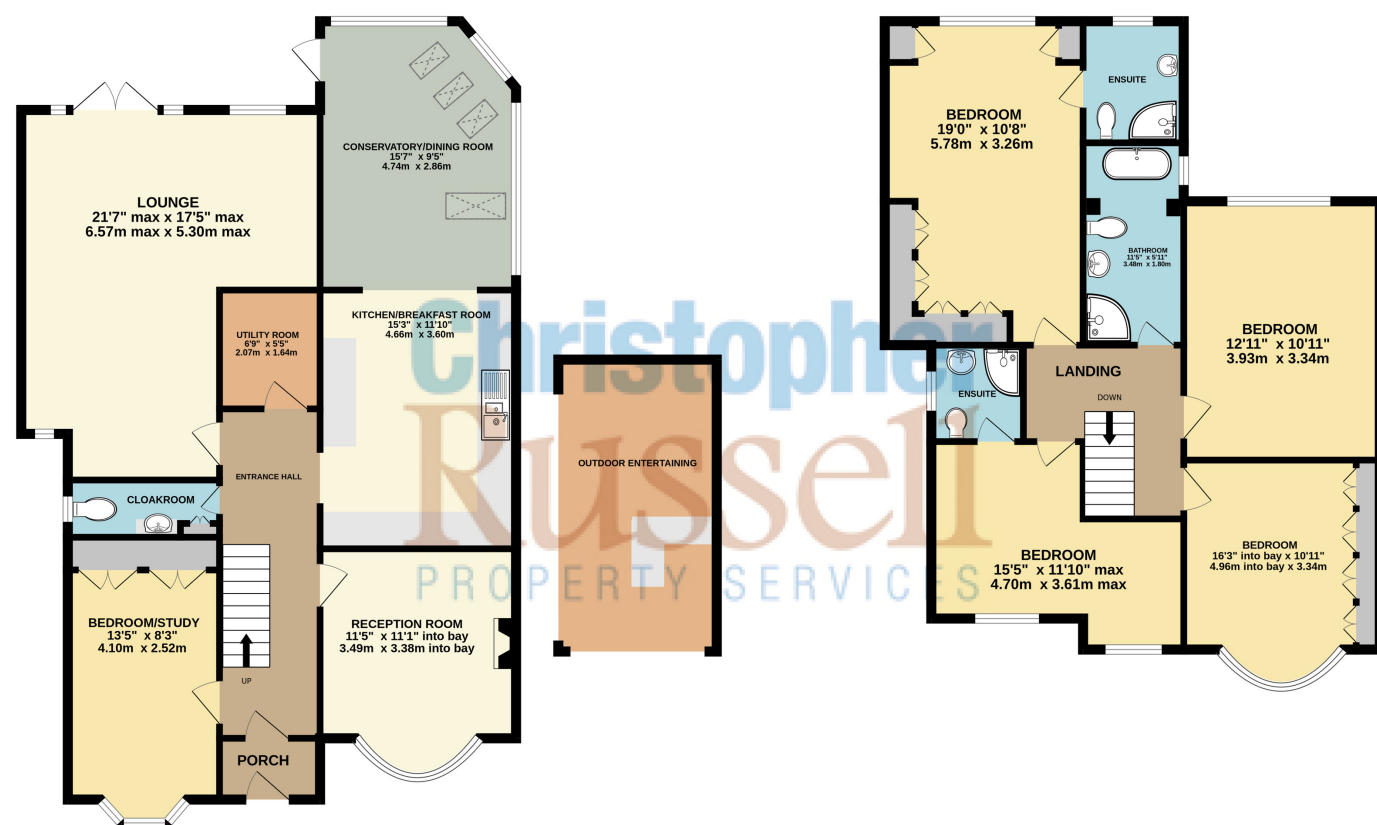
TOTAL FLOOR AREA: 2184 sq.ft. (202.9 sq.m.) approx.

Whilst every attempt has been made to ensure the accuracy of the floorplan contained here, measurements of doors, windows, rooms and any other items are approximate and no responsibility is taken for any error, omission or mis-statement. This plan is for illustrative purposes only and should be used as such by any prospective purchaser. The services, systems and appliances shown have not been tested and no guarantee as to their operability or efficiency can be given. Made with Metropix ©2024