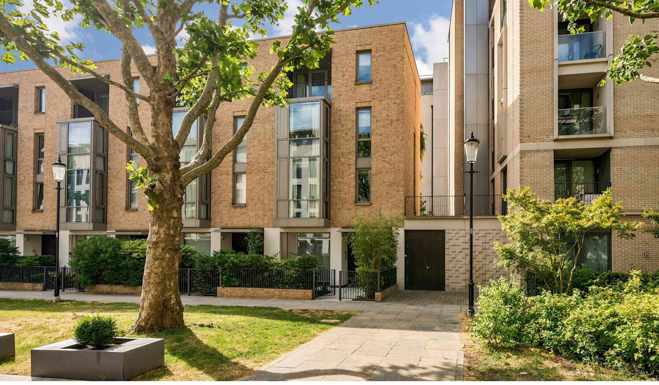
Bonchurch Road, London, W10 5LH