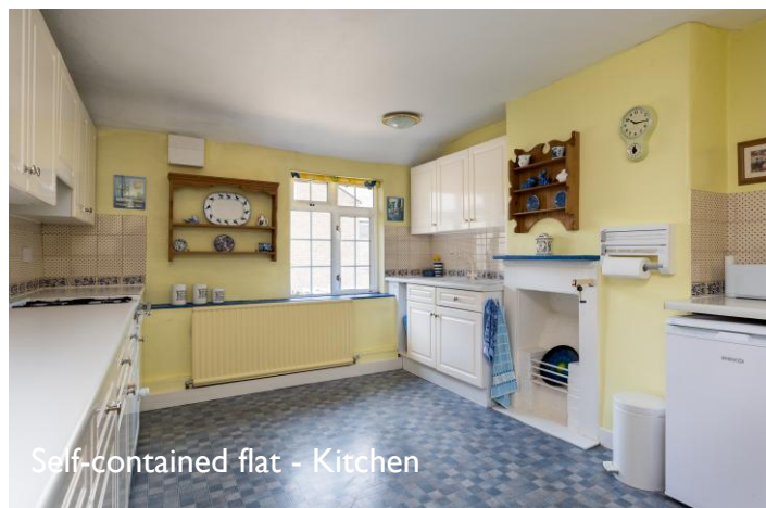
Self-contained flat - Kitchen