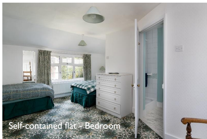
Self-contained flat - Bedroom