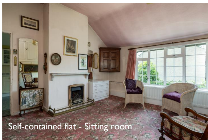
Self-contained flat - Sitting room