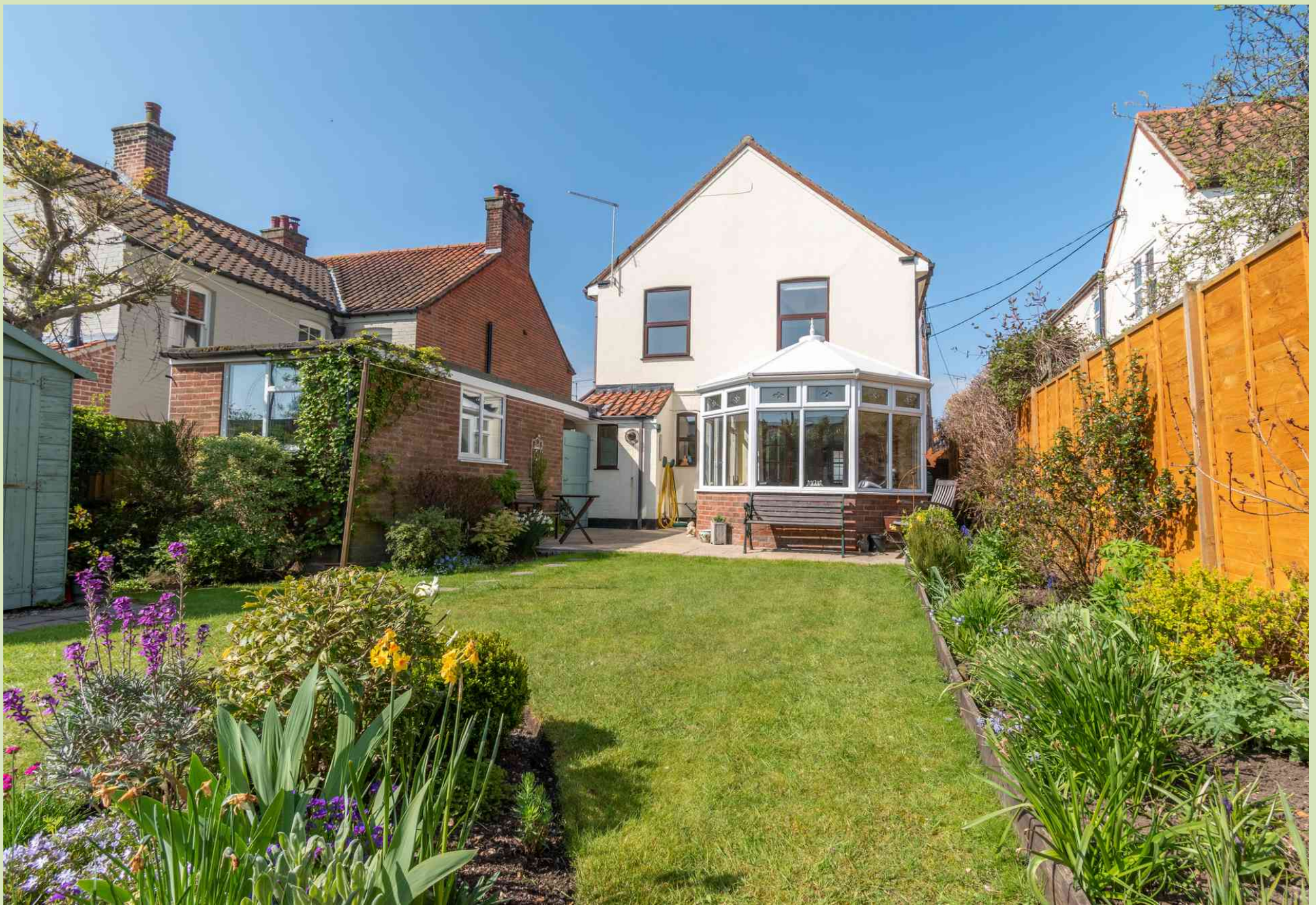
5 Ratcliffe Road, Fakenham Guide Price £360,000