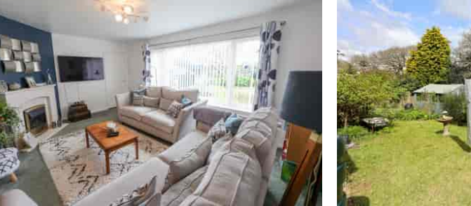
COMING SOON FURTHER DETAILS

A DETACHED DORMER STYLE FOUR BEDROOM HOUSE ENJOYING AN END OF CUL DE SAC POSITION WITHIN THE SOUGHT AFTER VILLAGE OF STICKER. THE PROPERTY OFFERS INDIVIDUAL VERSATILE ACCOMMODATION WHICH COMPRISES OF ENTRANCE PORCH, HALL, LOUNGE, SEPARATE DINING ROOM, BEAUTIFUL SUN LOUNGE, KITCHEN, SHOWER ROOM, GROUND FLOOR DOUBLE BEDROOM, THREE BEDROOMS TO THE FIRST FLOOR, AND WET ROOM. OUTSIDE MATURE GARDENS TO THE FRONT AND REAR.