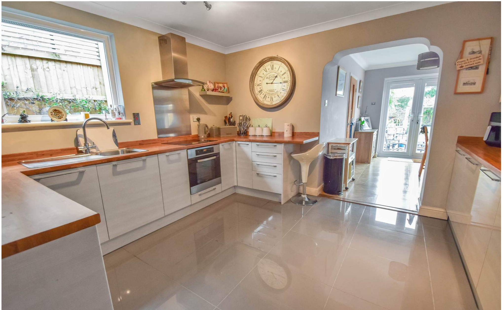
DARGETS ROAD, CHATHAM, KENT, ME5 8BL