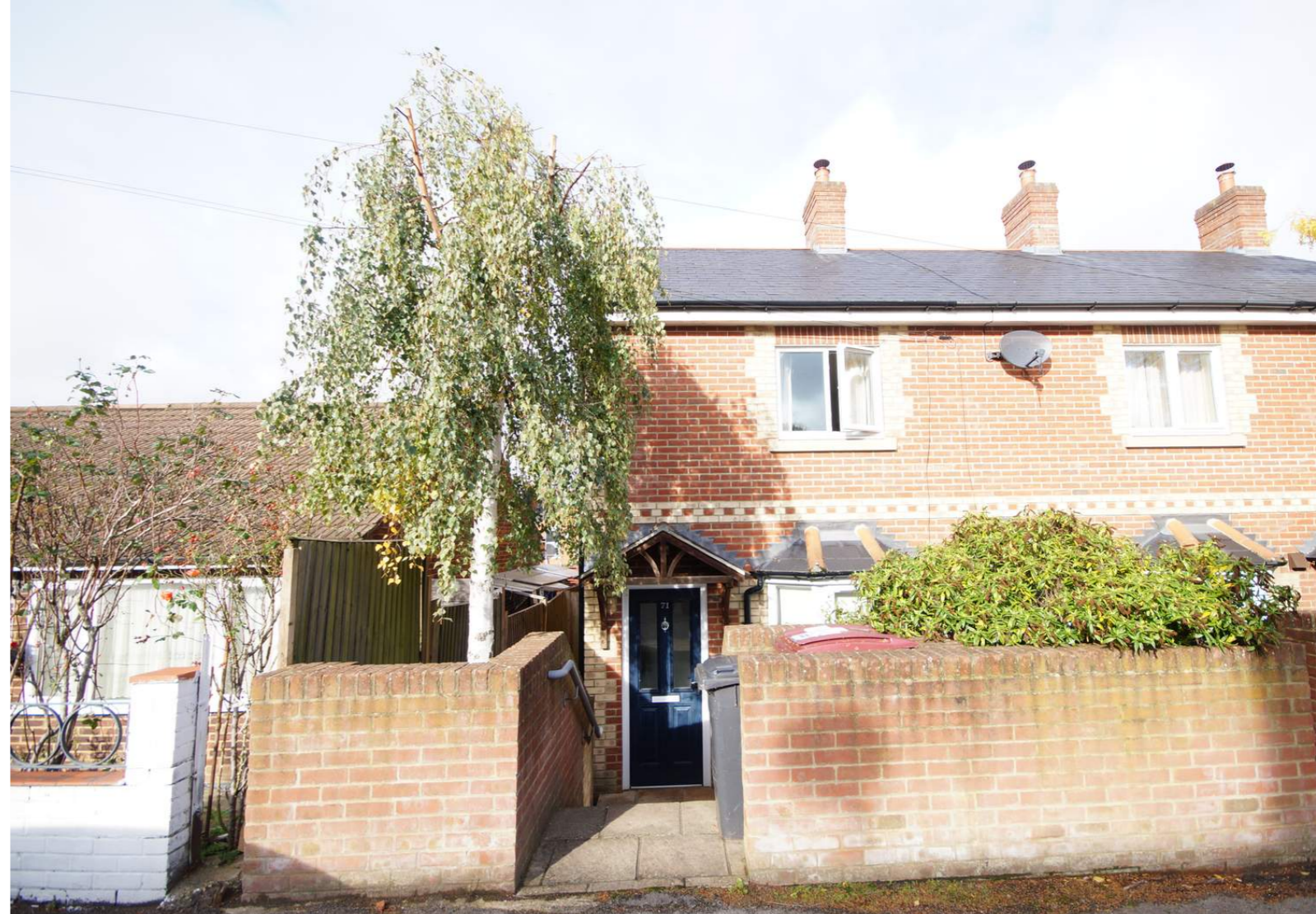
71 Brighton Road, Reading, Berkshire. RG6 1PS.