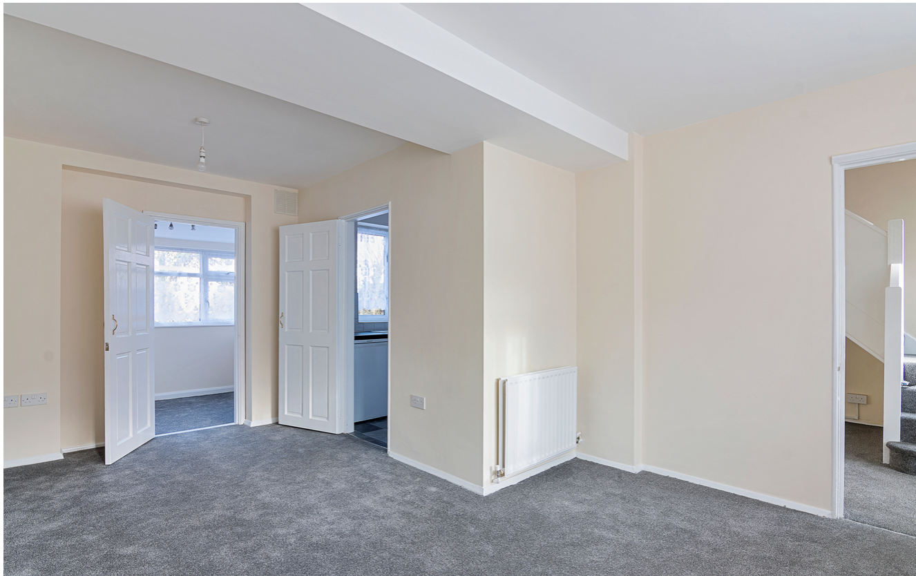
21 Langdon Road, East Ham, London. E6 2QB.