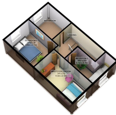
1ST FLOOR APPROX. FLOOR AREA 419 SQ.FT. (38.9 SQ.M.)