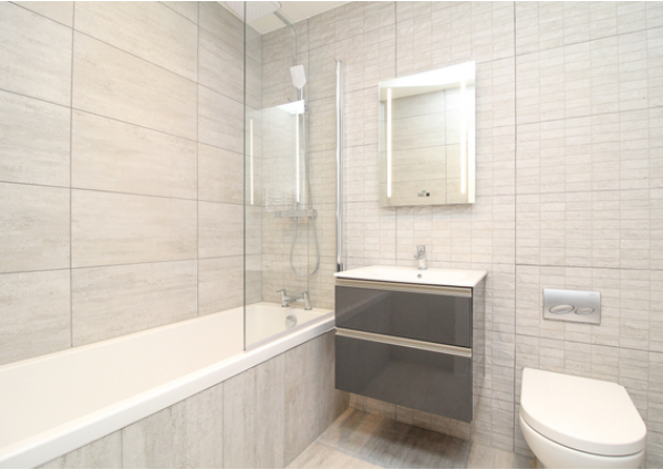
Bathroom 2.30m x 1.90m (7' 7" x 6' 3")