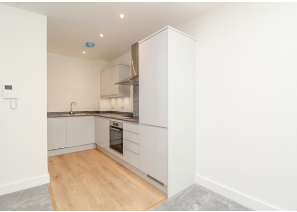
Living/Kitchen/Diner 6.50m x 3.50m (21' 4" x 11' 6") Max.