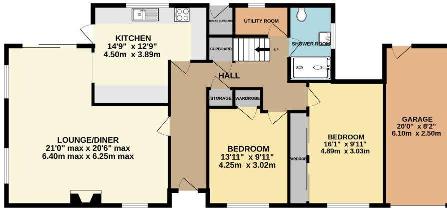
GROUND FLOOR 1287 sq.ft. (119.6 sq.m.) approx.