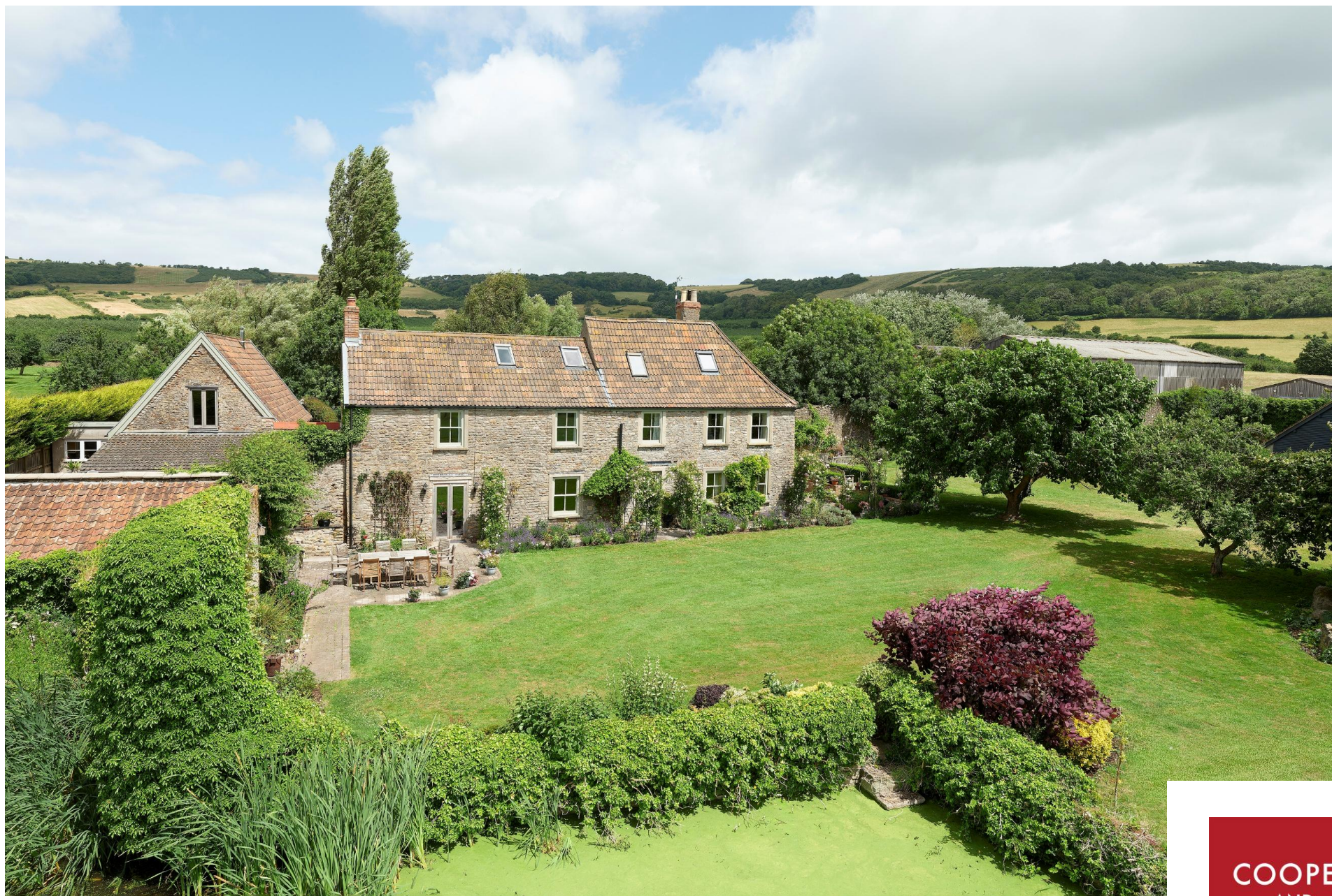
Lake Farm, Bleadon, North Somerset BS24 0NY