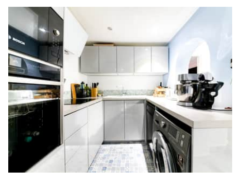
Elm Road, Thornton Heath, Surrey, CR7 8RH