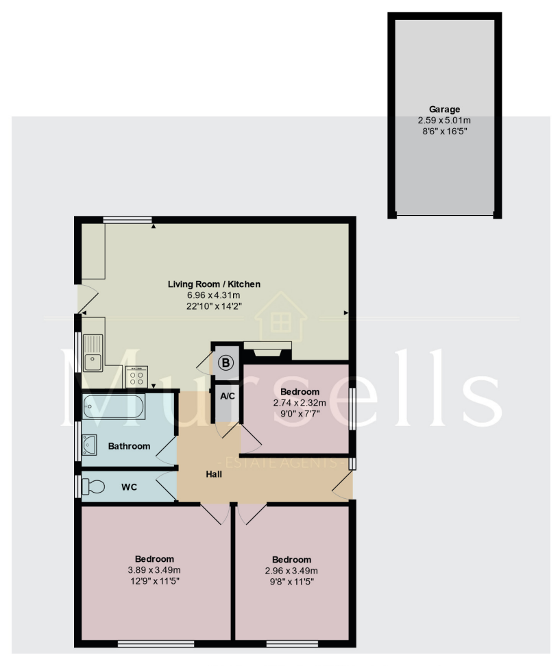
Total Area: 76.0 m² ... 818 ft² (excluding garage) All measurements are approximate and for display purposes only