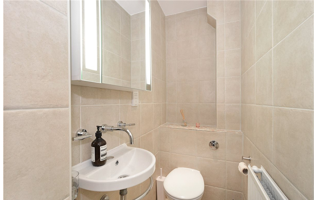
Flat 2, 49 Weymouth Street, Marylebone, London, W1G 8NG £807 p/w