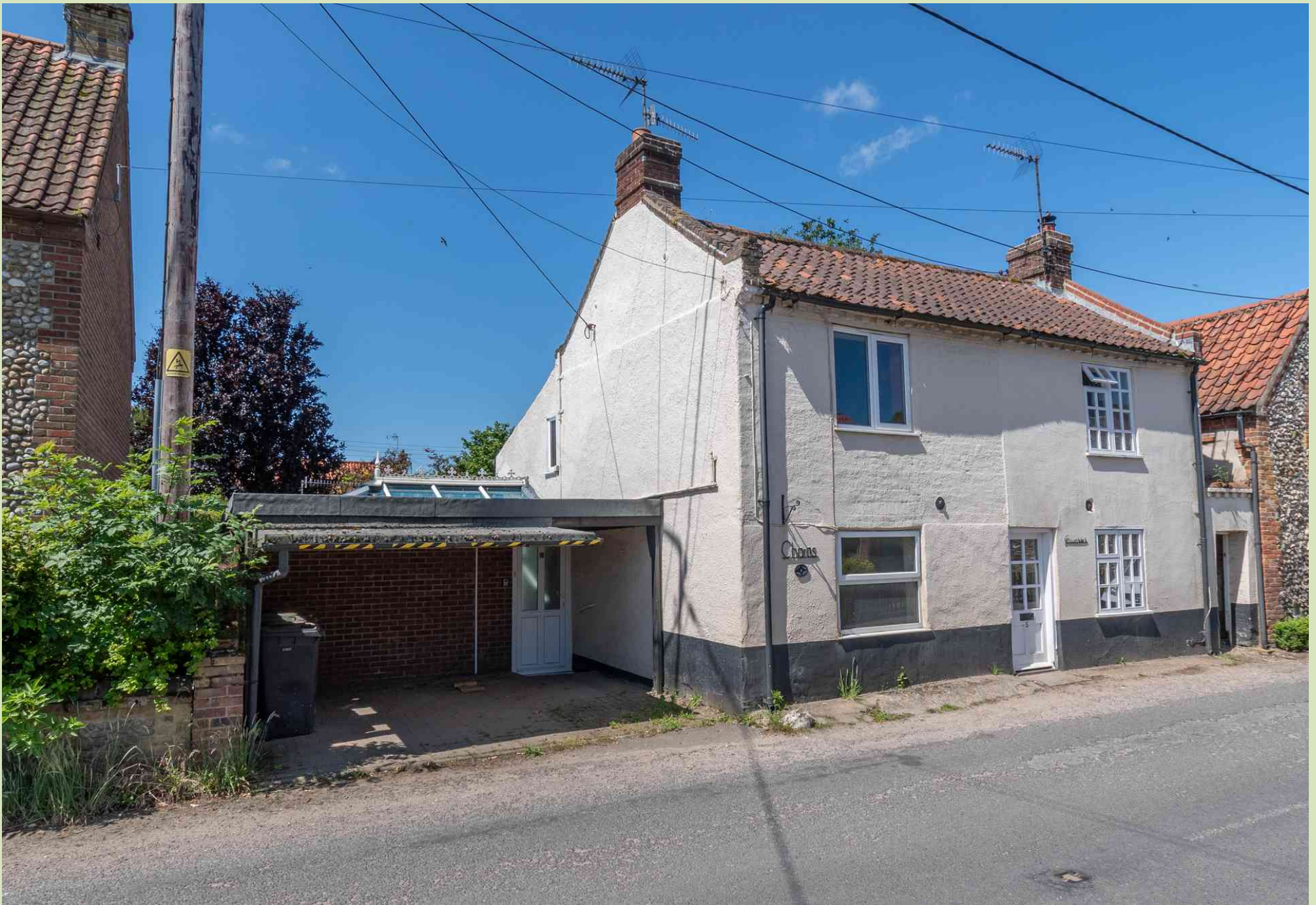
Charos, South Creake Guide Price £250,000