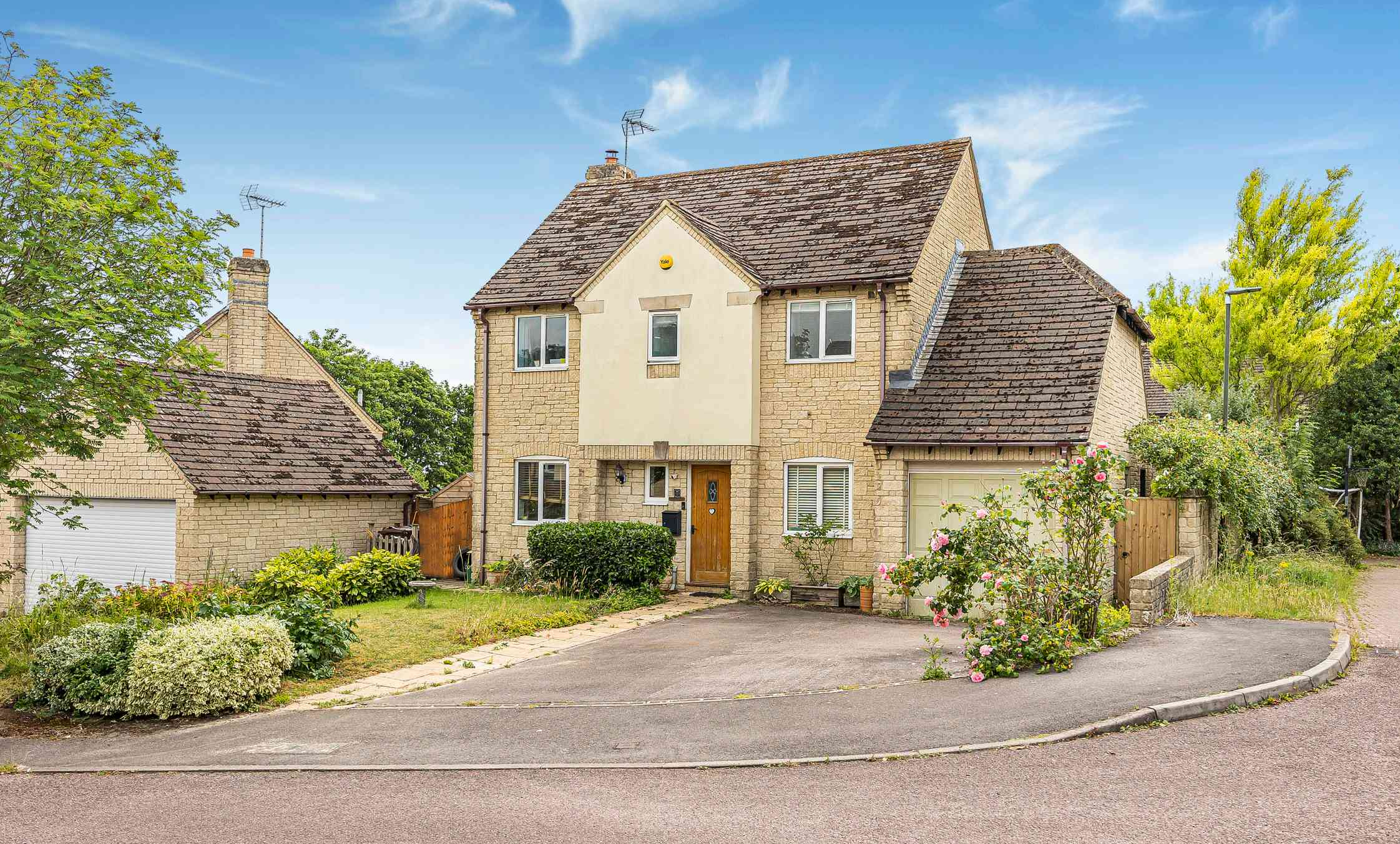
14 Sparrow Close, Chalford, Stroud, Gloucestershire, GL6 8FP Guide Price £470,000