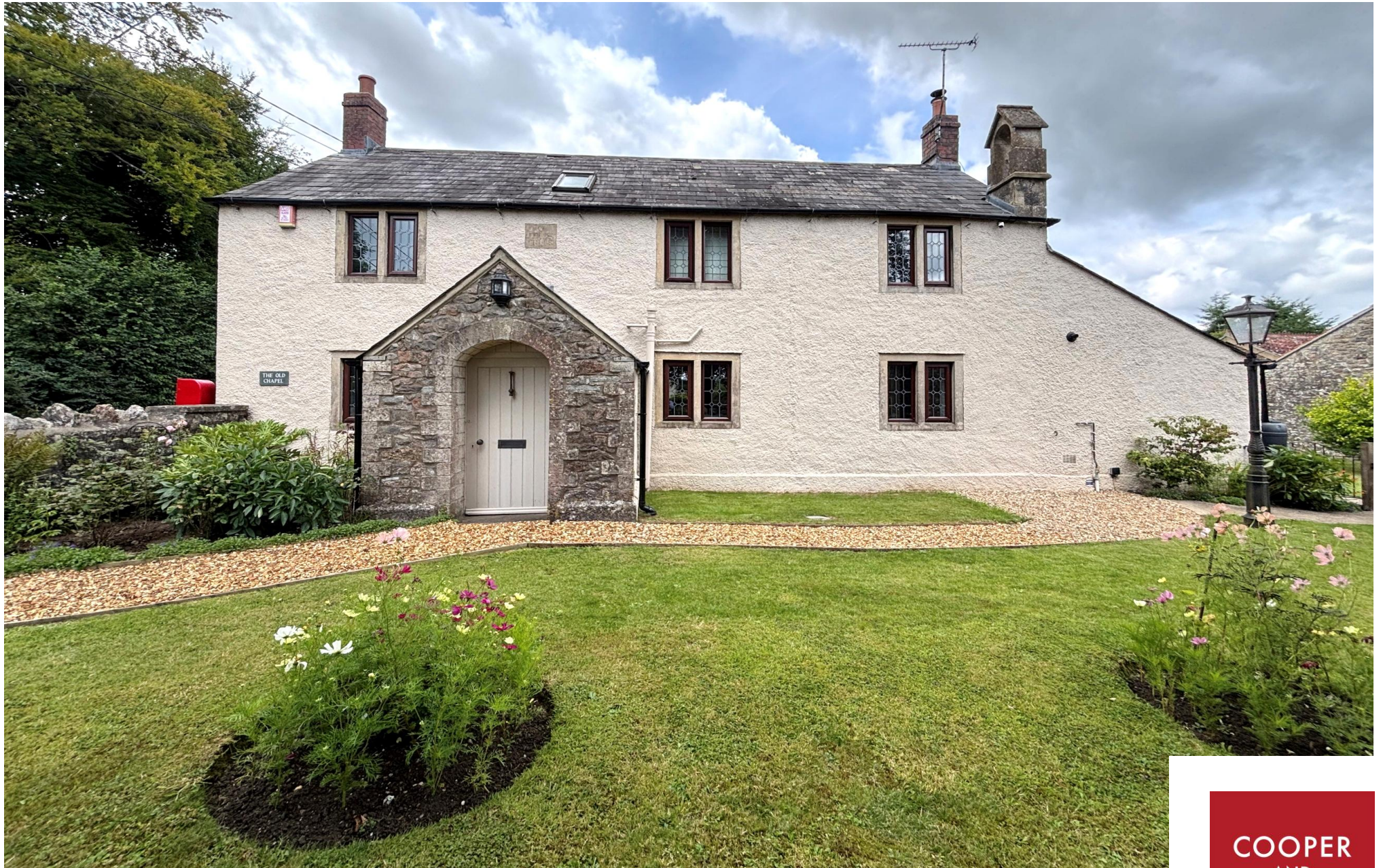
The Old Chapel, Green Ore, Nr Wells, BA5 3ES