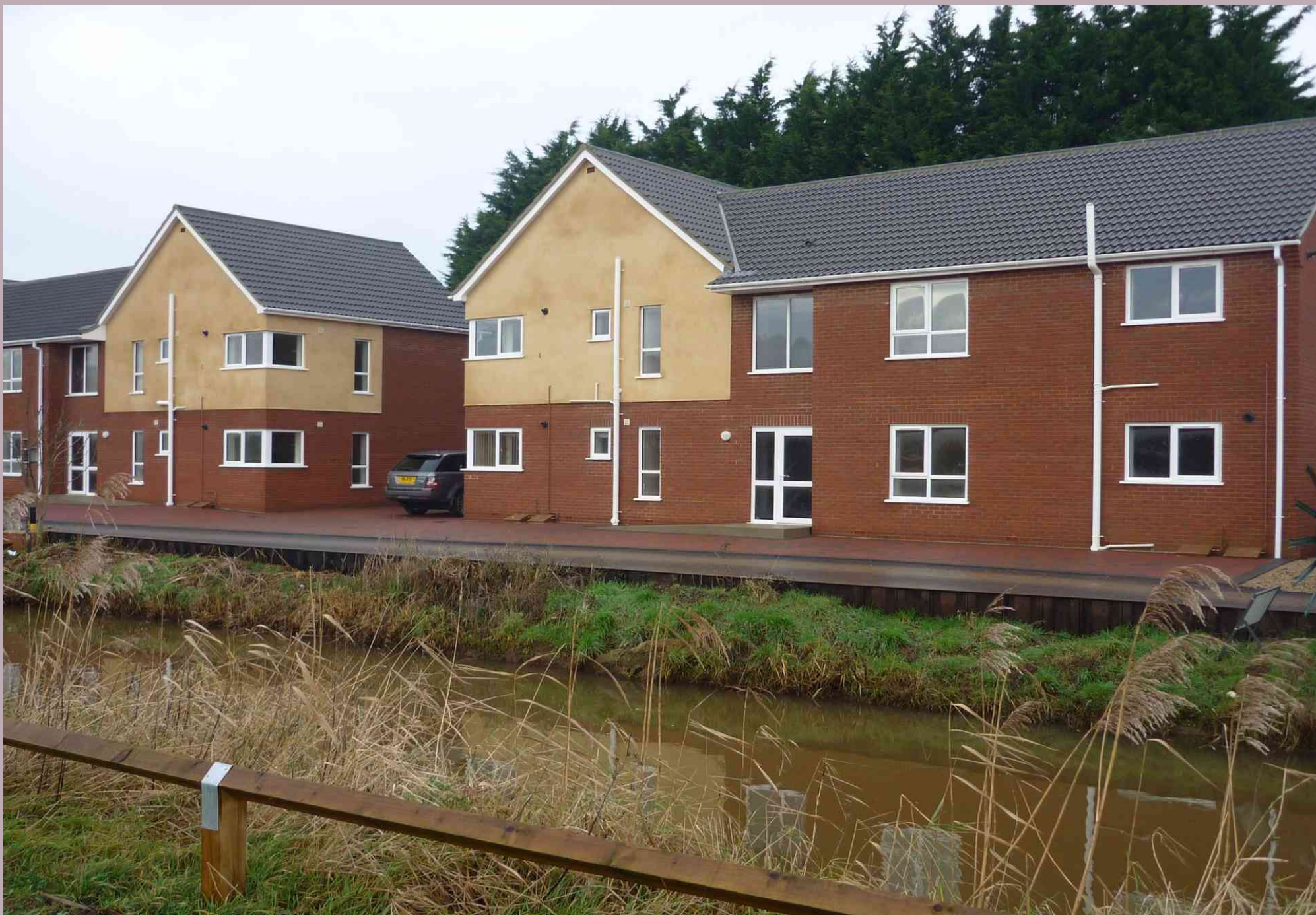
5D Bridge Place, King's Lynn £725 per calendar month