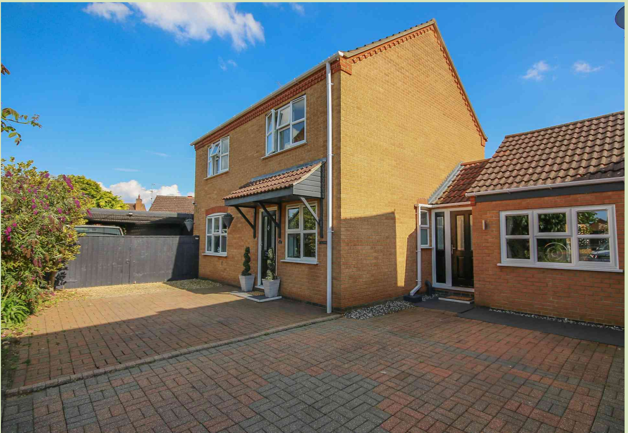
12 Shouldham Close, Dersingham Guide Price £400,000