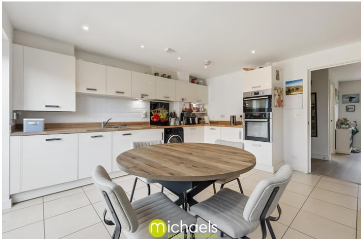
18' 1" x 15' 5" (5.51m x 4.70m)