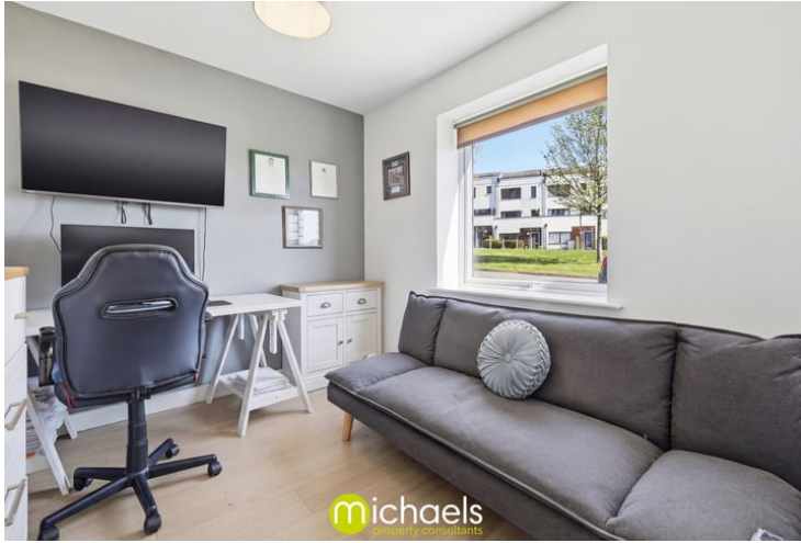
10' 6" x 8' 6" (3.20m x 2.59m)