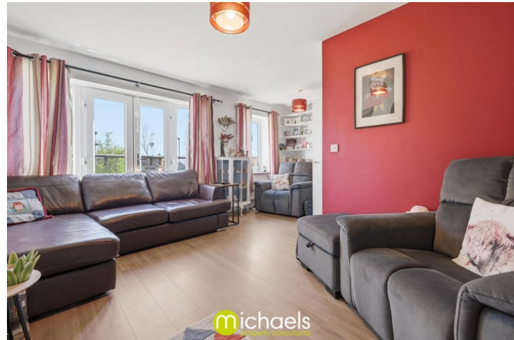
18' 1" x 13' 9" (5.51m x 4.19m)