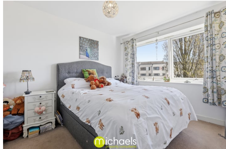
18' 1" x 11' 5" (5.51m x 3.48m)