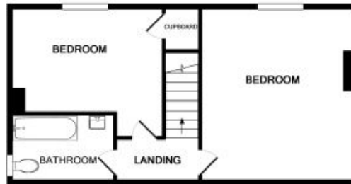
1ST FLOOR APPROX. FLOOR AREA 390 SQ.FT. (36.3 SQ.M.)