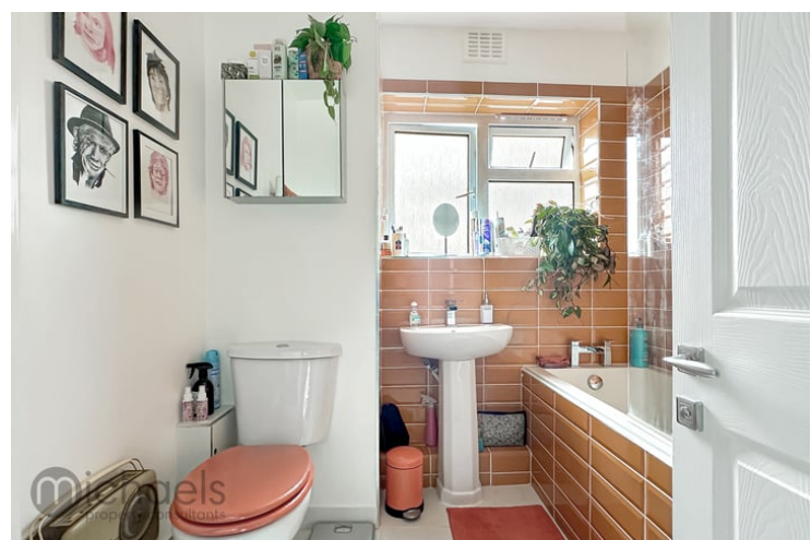
7' 2" x 6' 8" (2.18m x 2.03m) UPVC window to rear aspect, tiled bathroom suite, bath with shower attached, low level W.C, vanity wash basin, radiator.