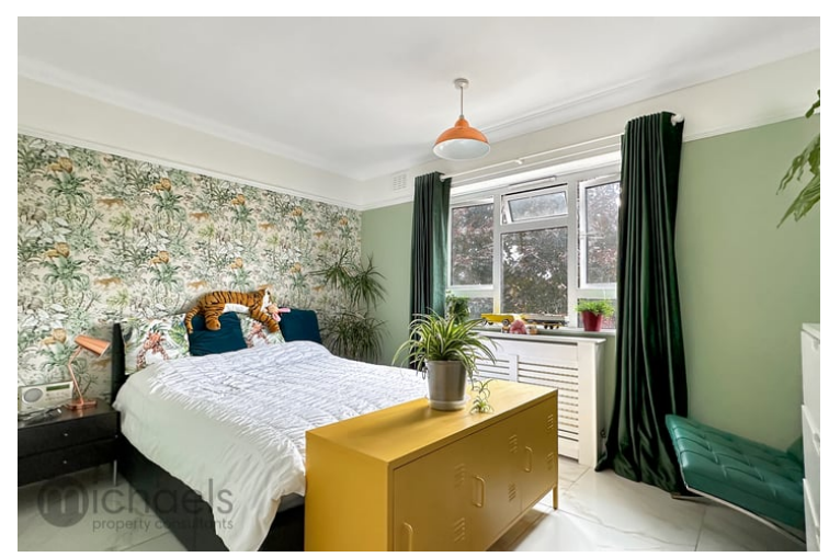
13' 0" x 9' 8" (3.96m x 2.95m) UPVC window to side aspect, radiator, tiled flooring.