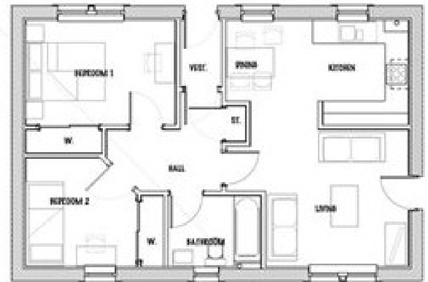
FLOOR PLAN Footprint area - 74.88 sqm.

This brand new detached bungalow forms part of a planned development on the south western edge of Buckhaven. Finished and decorated to a high order, accommodation comprises; Hall with storage, Lounge, modern fitted kitchen, two bedrooms both with fitted mirrored wardrobes and Family Shower Room. Double glazing, combination boiler and solar panels. Generous sized garden with mono block drive for two family cars. THIS IS A BRAND NEW PROPERTY SO HOME REPORT REGULATIONS DO NOT APPLY